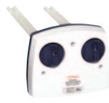
Whole-House Ultraviolet Treatment